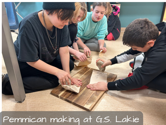
Pemmican making at G.S. Lakie

Check out what our Middle School's did this month!