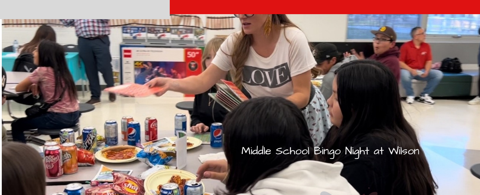
Middle School Bingo Night at Wilson