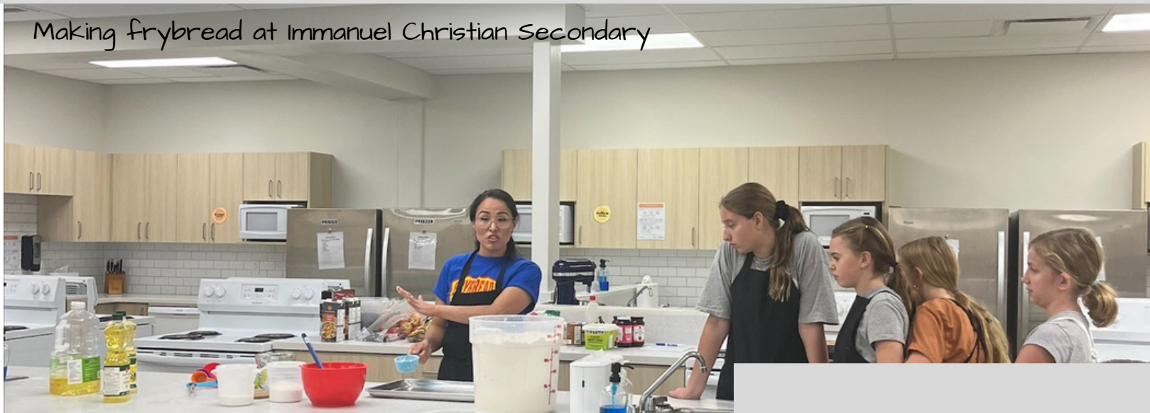
Making frybread at Immanuel Christian Secondary

Reach out to our Indigenous Education team if you'd like more information on any of these resources or others!