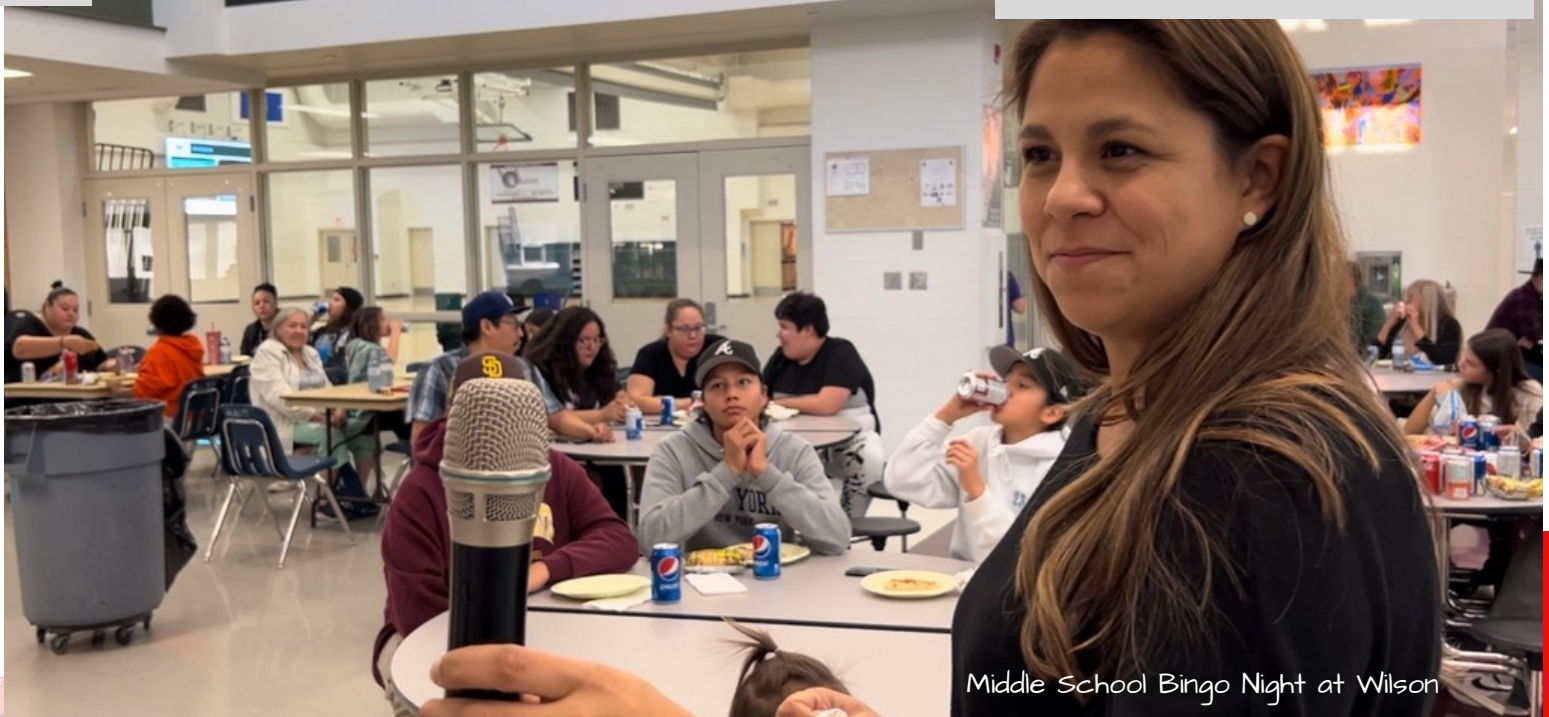
Middle School Bingo Night at Wilson

NOVEMBER 2023 INDIGENOUS EDUCATION NEWSLETTER